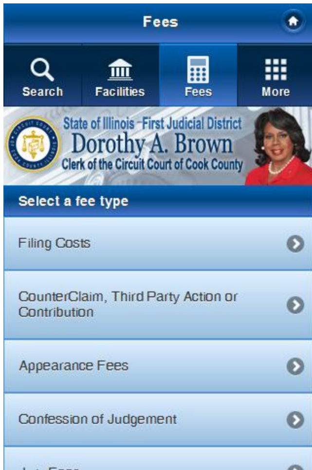
Fee Menu Screen