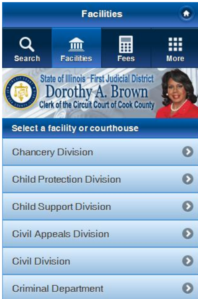
Facilities menu Screen